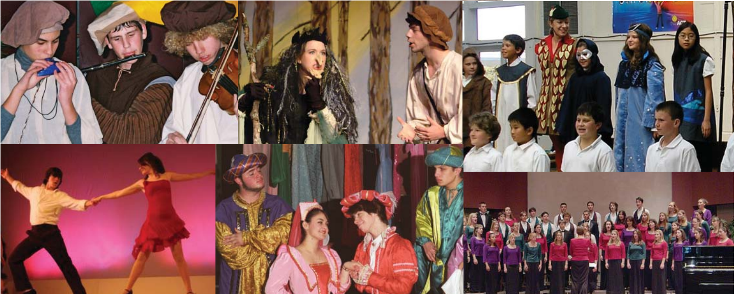
Students from Lynwood Elementary, San Marin HS and Novato HS demonstrate their visual and performing arts skills.